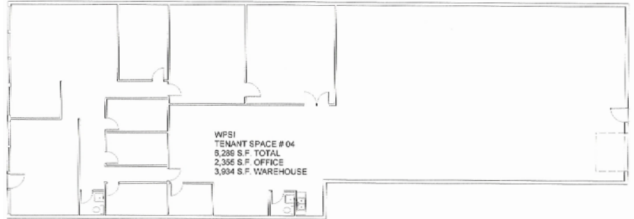
UNIT 4 FLOOR PLAN