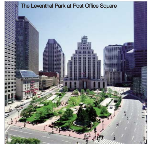
The Leventhal Park at Post Office Square

Central Financial District location. Upgrades to lobby and common hallways. Full floor identity. Convenient to MBTA public transportation. Easy access to Faneuil Hall Marketplace and The Leventhal Park at Post Office Square.