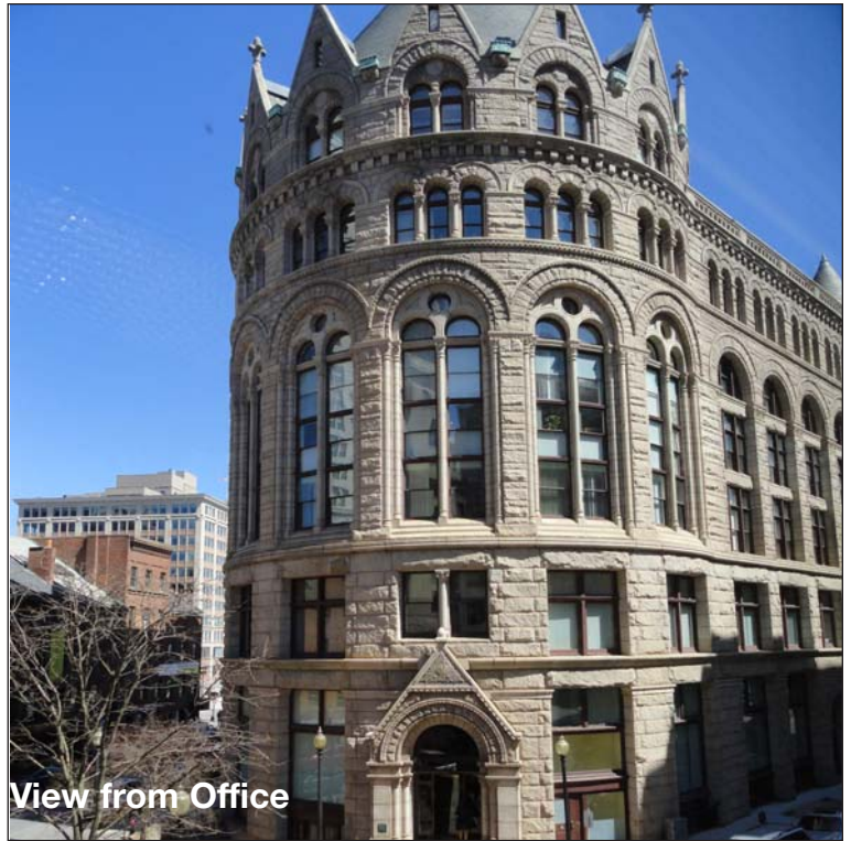
View from Office