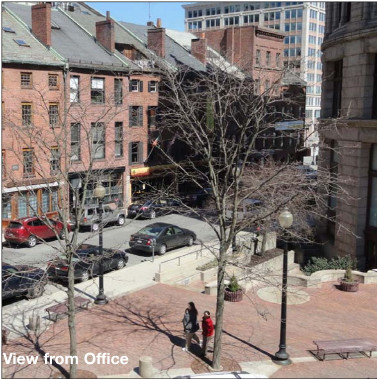
View from Office